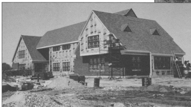
Roofing completed, siding under way, May, 1987