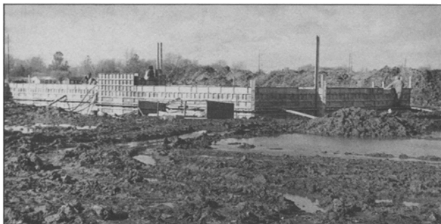
Foundation work on December 3, 1986

On April 26, 1970, the AOCS Governing Board approved a